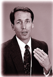
"My role as my brother's agent is to make sure his wishes are followed."